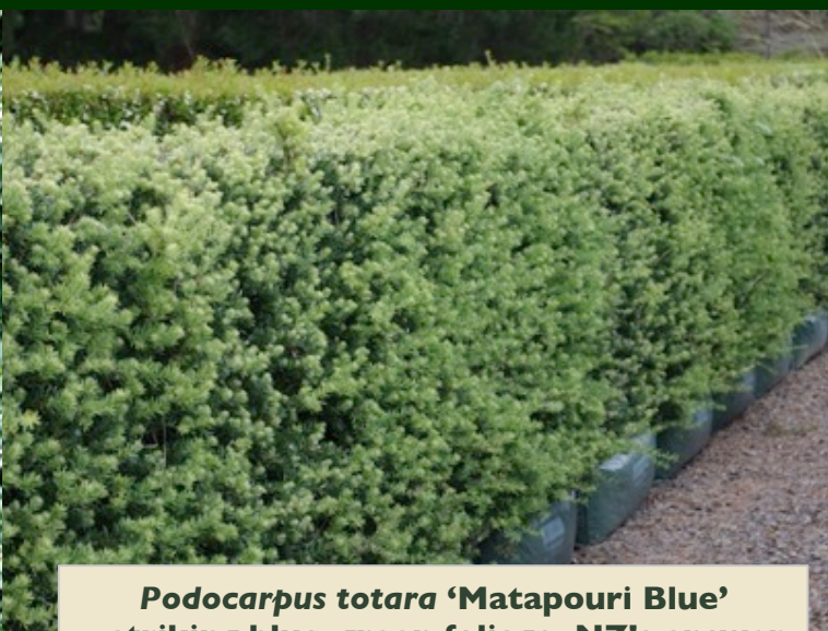
Podocarpus totara 'Matapouri Blue' - striking blue-green foliage, NZ's answer to the English Yew hedge; native