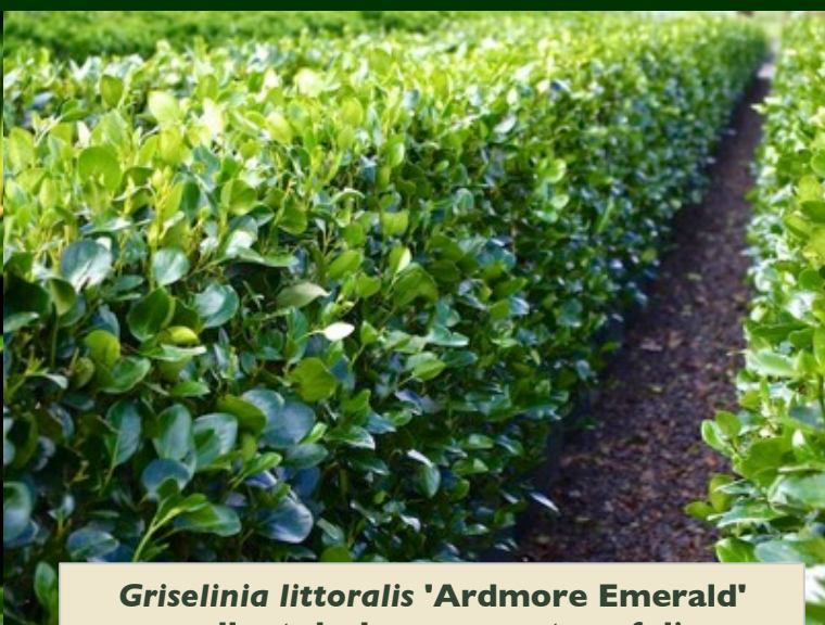
Griselinia littoralis 'Ardmore Emerald' - excellent dark green mature foliage; native hedge