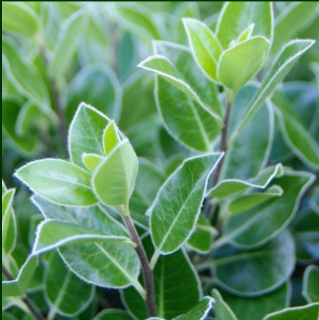
Pittosporum ralphii 'Stephens Island' - fabulous foliage, quite at home in exposed, coastal gardens; native hedge