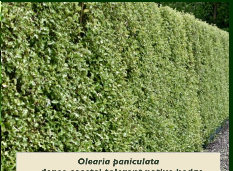
Olearia paniculata - dense coastal tolerant native hedge, suitable throughout NZ