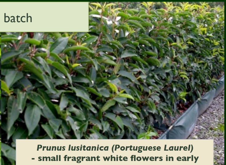
Prunus lusitanica (Portuguese Laurel) - small fragrant white flowers in early summer; very hardy hedge, suitable throughout NZ