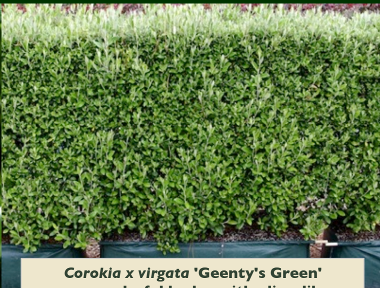
Corokia x virgata 'Geenty's Green' - a wonderful hedge with olive-like foliage; native