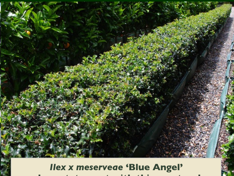
Ilex x meserveae 'Blue Angel' -make a statement with this spectacular, rich, dark and glossy holly hedge