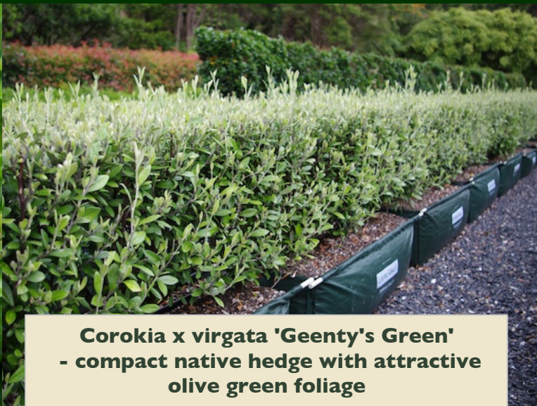
Corokia x virgata 'Geenty's Green' - compact native hedge with attractive olive green foliage