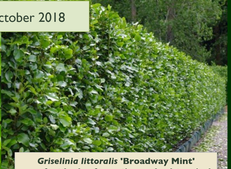
Griselinia littoralis 'Broadway Mint' - perfect hedge for native and subtropical plantings with its lush foliage