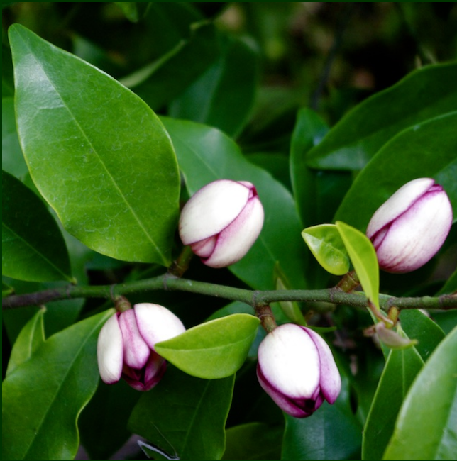
Michelia figo (Port Wine Magnolia) - magnificent summer fragrance, semi-shade tolerant flowering hedge