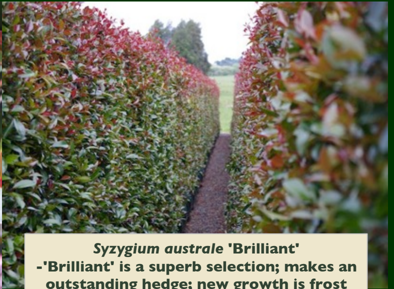
Syzygium australe 'Brilliant' - 'Brilliant' is a superb selection; makes an outstanding hedge; new growth is frost tender