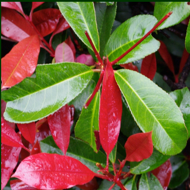
Photinia 'Red Robin' dark green hedge with red new growth in warmer months