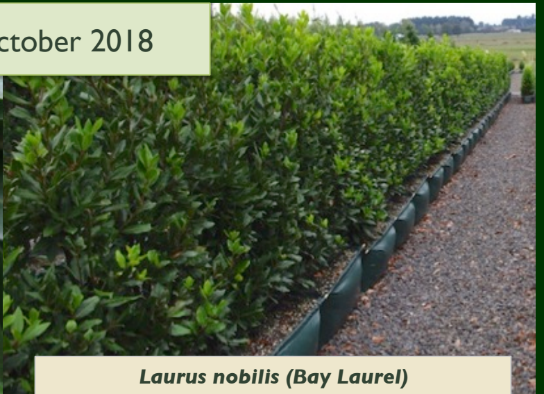
Laurus nobilis (Bay Laurel) - dark green hedge at home in any area of the garden; hardy