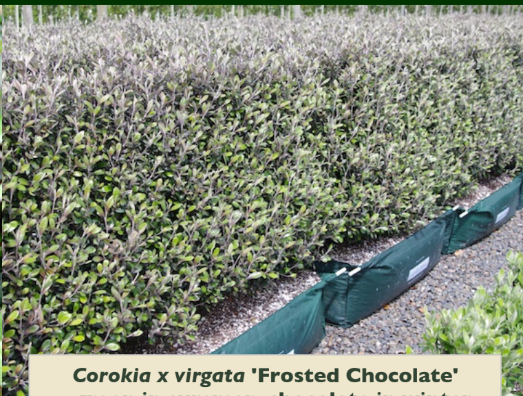
Corokia x virgata 'Frosted Chocolate' - green in summer, chocolate in winter, gorgeous and dense; native hedge