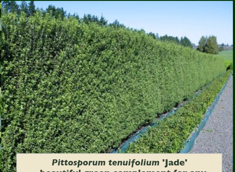
Pittosporum tenuifolium 'Jade' - beautiful green complement for any sunny garden style; native hedge