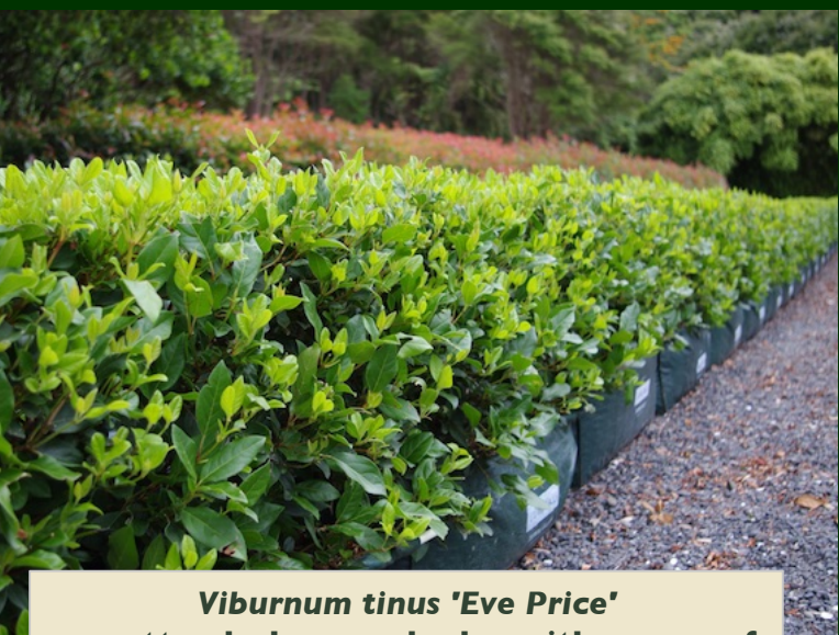
Viburnum tinus 'Eve Price' - pretty, dark green hedge with sprays of flowers, winter through spring.